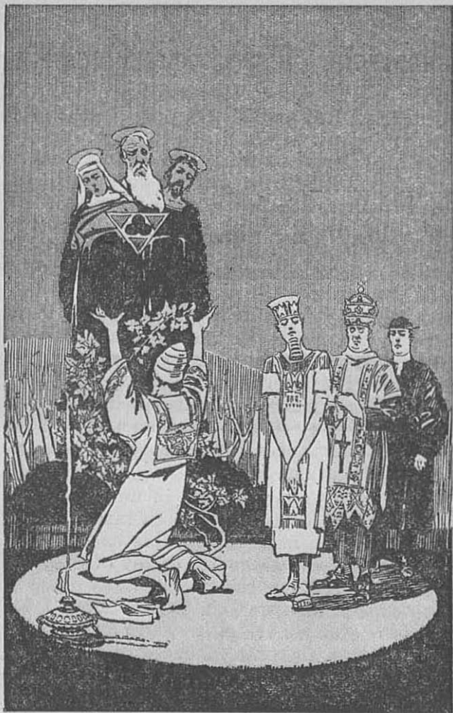
Worship of the trinity