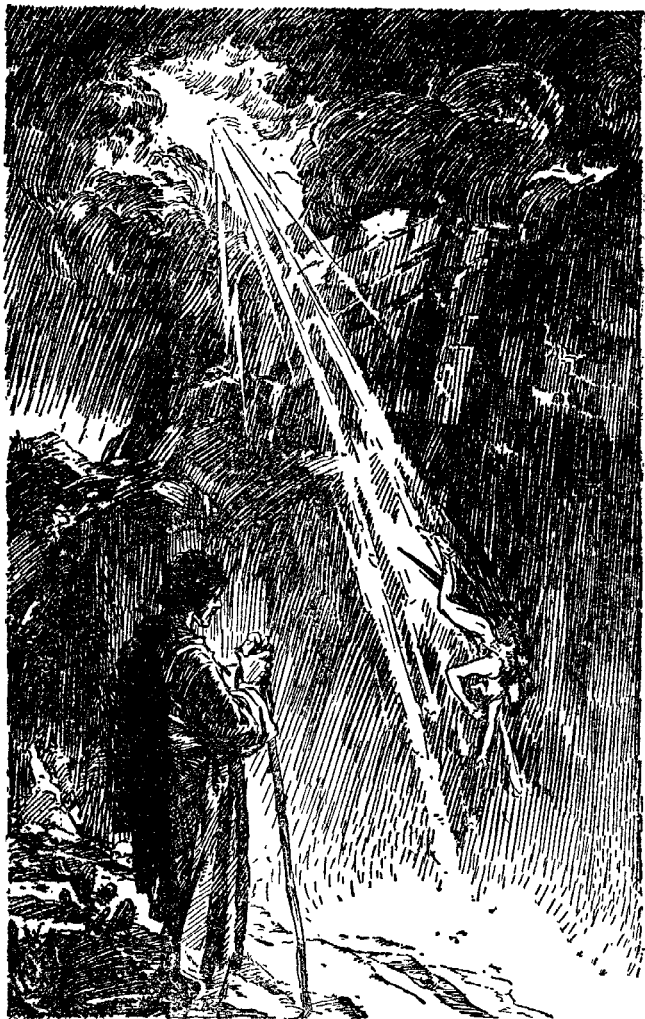
SATAN CAST OUT OF HEAVEN Page 239