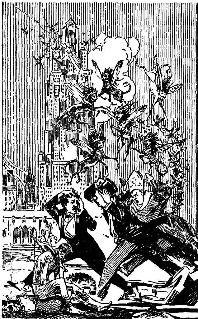
LOCUSTS DELIVERING THE TESTIMONY Pages 148, 149