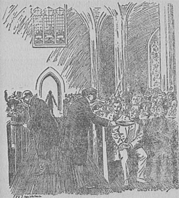
A MORE HONORABLE WAY

Again the money-changers are operating in the house of the Lord, and again seem appropriate the words of the Master: "It is written, My