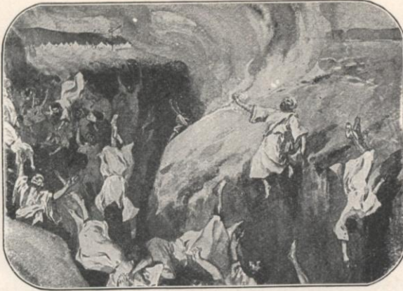
Numbers 16 :1-3, 27-33, Leeser

And K is for Korah; With a company of men Displeased God so much that The earth swallowed them.