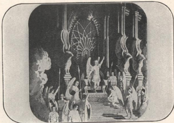
Isaiah 14 :12-14, Leeser

And K is for Korah; With a company of men Displeas'd God so much that The earth swallow'd them.