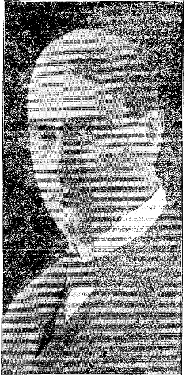
A FRIEND OF THE PEOPLE

"HOPE for the people lies in the kingdom of God now at hand. Millions are now living who will see that kingdom in operation and if obedient to its righteous laws will never die, but will live on earth forever in happiness, peace and prosperity. The world's darkest hour is just before its greatest blessing."