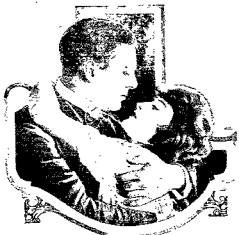
THOMAS MEIGHAN and MARTHA HANFIELD in a scene from "CIVILIAN CLOTHES" - A PANORAMIC PICTURE